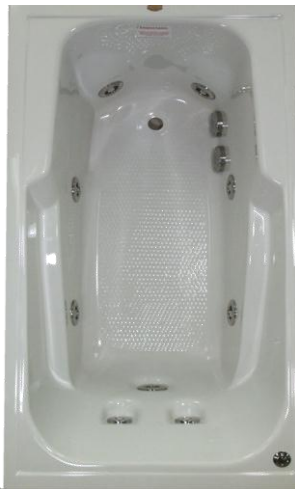
60"x32"x20" Shipping weight - 120lbs

Inside Bottom Dimension 39"L x 16"W(+/- 1/2")